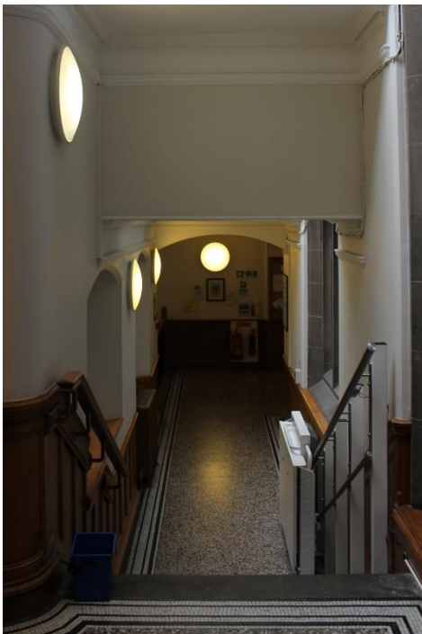
New chair lift in refurbished corridor