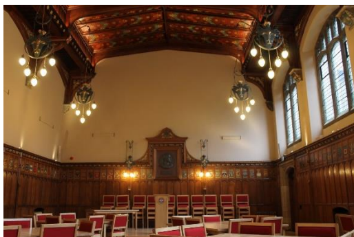
Fully restored Rainy Hall