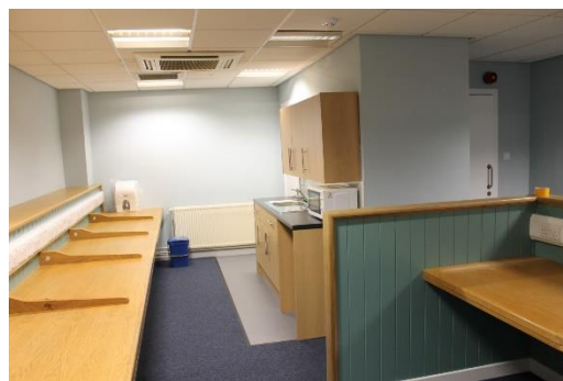
Upgraded simple room